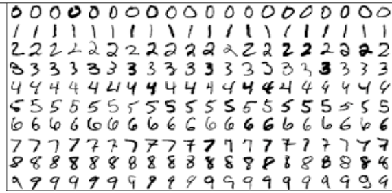
Figure 1 sample of handwritten digits

The data use for training is made of 8*8 images of digits. All the images have same size. To apply classifier on data, image need to turn into sample feature matrix. Then apply SVM classifier to train a model for further predictions.